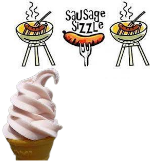
Sausage Sizzle and Icecream available to purchase.